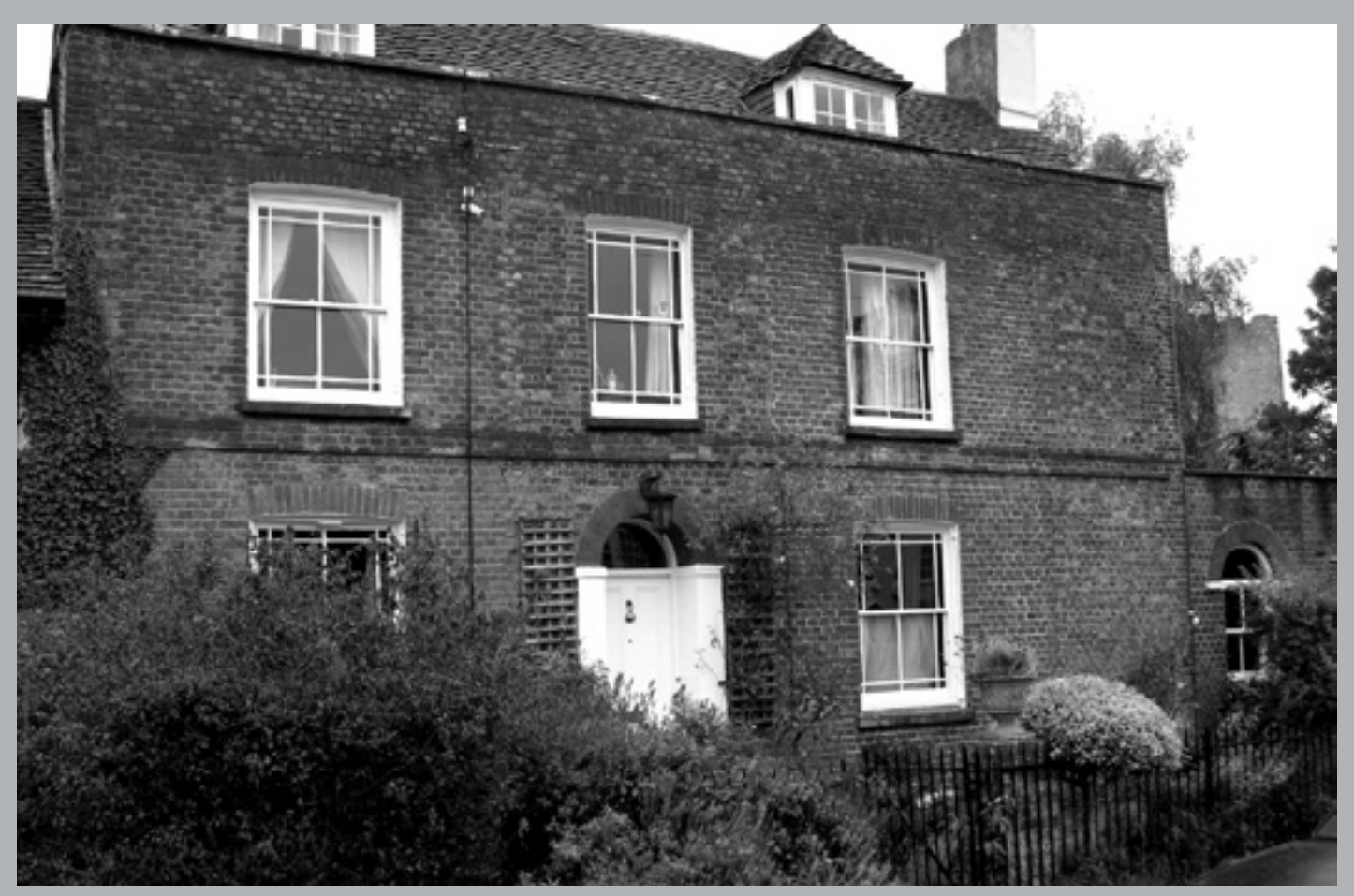
The Kings Arms, now a private house in Castle Stree

DURING THE BREAK FOR PEACE Lord Hobart circulated the local volunteers in November 1802 in an effort 'to make them more effective'. A company of 50 privates was to have a captain,