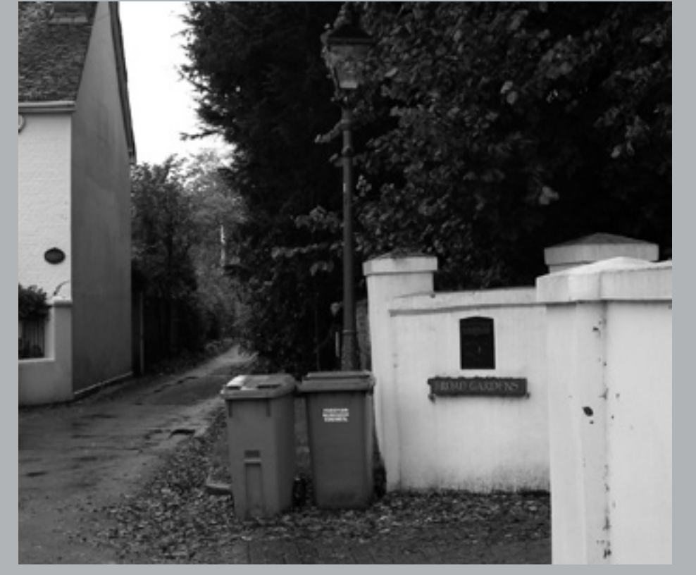
Broad Gardens and Hospital Lane