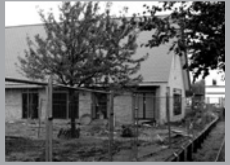
New Community Centre

I'm pleased to see the new Community Centre is nearing completion. There has