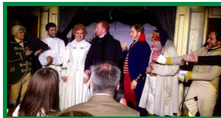
Members of the cast take a bow