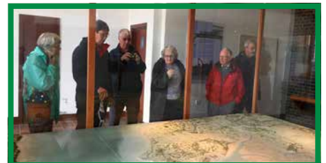
Admiring the plan of Portsmouth defences