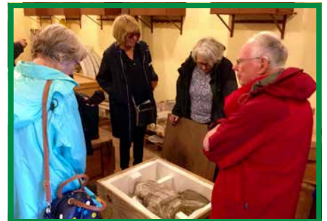
A piece of Southwick Priory

We ended our tour with her showing us a section of marble from Southwick Priory