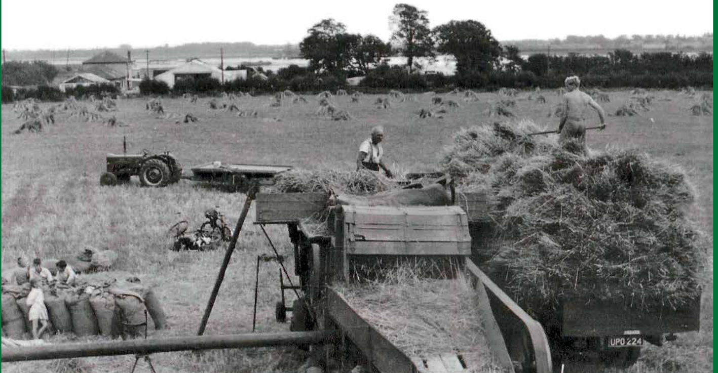
Portchester Lost - Haymaking on Little Wicor Farm, looking over Cranleigh Road towards Wicor Marine