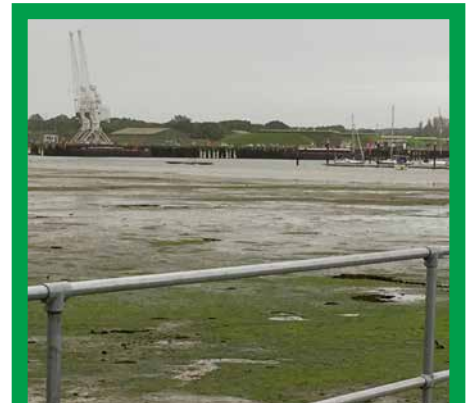
Bedenham Pier today