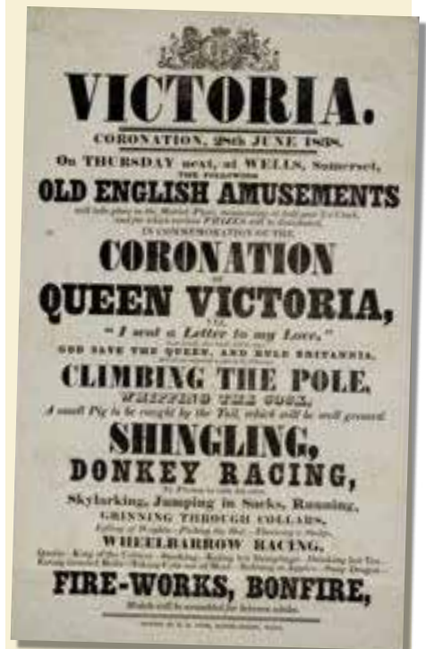
A poster advertising typical Old English Amusements at Wells, Somerset on Queen Victoria's Coronation Day