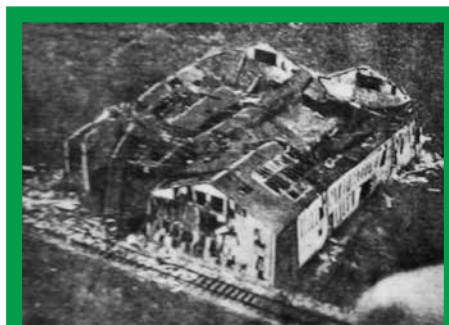
One of the ammunition store sheds wrecked by the explosion

As with many such events, there were heroes. Awards for Gallantry and Bravery were given