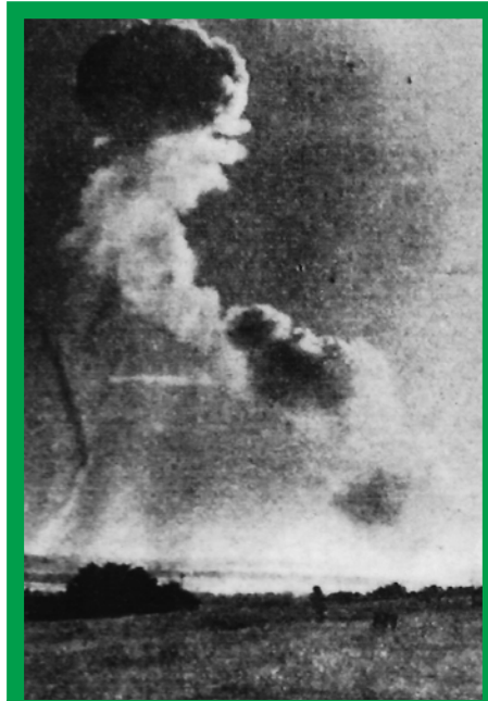
Smoke from the explosion; taken from Portsdown Hill

The lighter that ignited was inboard of the pier and two thirds full of explosives, with a strong offshore wind blowing over the lighter and onto the pier. In the lighter a depth charge was being lifted when a "muffled report" was heard, followed by a flash of yellow or blue flame. This