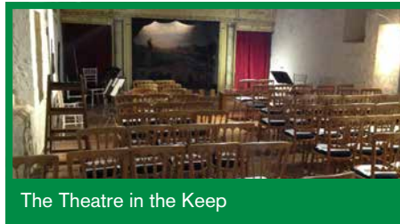
The Theatre in the Keep

was performed with music of the period from a six-piece orchestra. The stage is being retained in the Keep with the intention of staging further plays for the public. A magnificent performance and congratulations to all those involved.