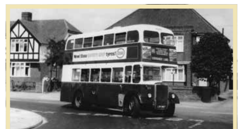
A 145 bus turns into White Hart Lane from Castle Street in August 1969

Until the late 1950s the Corporation bus route ran into the southern end of Castle Street where they would turn around at the