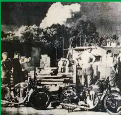
The second explosion seen from the Bedenham gates on the Fareham-Gosport road

After scouring the whole file, the information given in this report is all we have to make our decision on. Was it the result of a deliberate act or an accident?